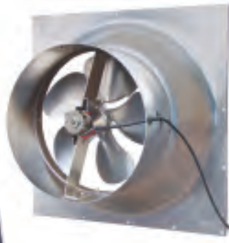
GABLE-MOUNTED UNIT 10 OR 20 WATT

up pressure within, making it work less effectively. Natural Light's design minimizes obstructions in the flashing and shroud and incorporates an angled throat to facilitate a venturi effect or suction effect to increase air flow. This improvement increases cfm output and also reduces wear on the motor!